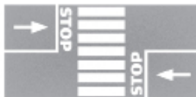
You must stop and give way and priority to pedestrians at this point