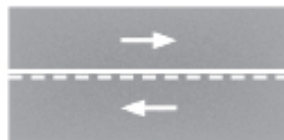
If the line on your side is broken, you may cross or overtake if safe enough