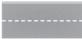
Centre line marking for a two-lane road with the road edge marked

We all notice the markings on the road. While boards are the first eminent markings, the lines painted on the road also have their own story to tell. Listed below are the major road markings seen in our country