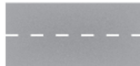
Centre line marking for a two lane road without the edges marked