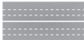
Centre barrier line marking for a six-lane road without edges marked