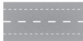
Lane line and broken centre line which allows overtaking