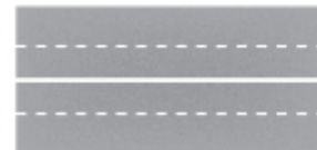
Centre barrier line marking for a four lane road without edges marked