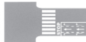
A stop line is a single solid line painted before the intersecting edge