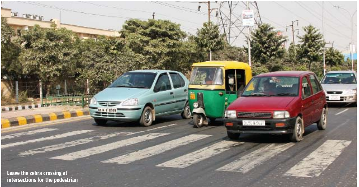
Leave the zebra crossing at intersections for the pedestrian