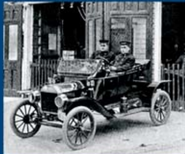
Model T soon became world famous and was seen in some of the most exotic locations the world over

They have been given a budget of Rs 30,00,000 and the deadline for the project is 1st September 2008. The design that meets the competition criteria and values of the Model T will earn two universities Rs. 10,50,000 each in scholarship funding. Final winners will be declared on 1st October 2008 on the 100th anniversary of the Model T.