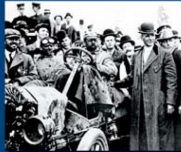
Henry Ford with his Transcontinental racing team. Ford drove from Denver to Seattle just to meet his winning team