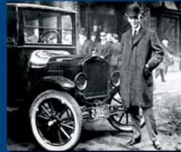
100 years before- Henry Ford created history with his creation the Model T that rocked the world during the 1910-20's