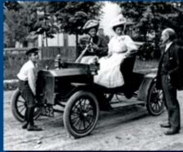
Initially, the car had to be started by rotating the crank with hand.