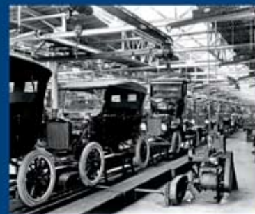
This is what revolutionized the way cars were built - the assembly line for Model T