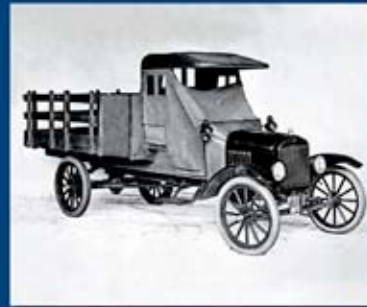
This is the Model TT truck based on longer and stronger version of the chassis for the passenger car